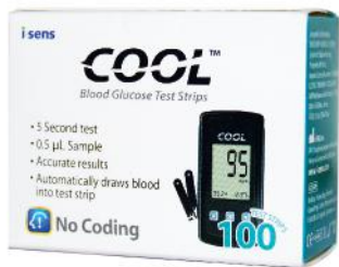
Cool Glucometer Test Strips

Accessories are always helpful in Providing Ease while Grinding through Daily Chores & Enhances Functionality as well.