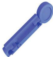
Cool Glucometer Lancet